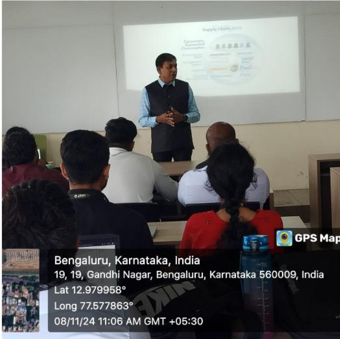
Bengaluru, Karnataka, India 19, 19, Gandhi Nagar, Bengaluru, Karnataka 560009, India Lat 12.979958° Long 77.577863° 08/11/24 11:06 AM GMT +05:30